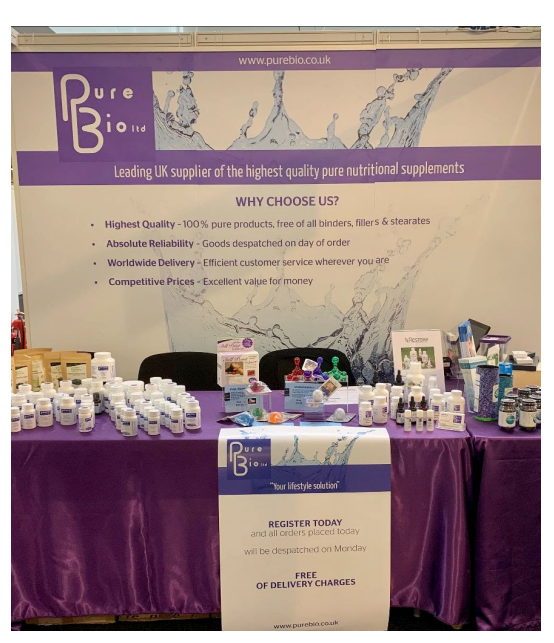
The Pure Bio stand at the Get Well Show

For more photos please see our latest news page on our website